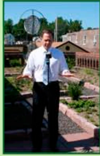
Mayor Francis Slay