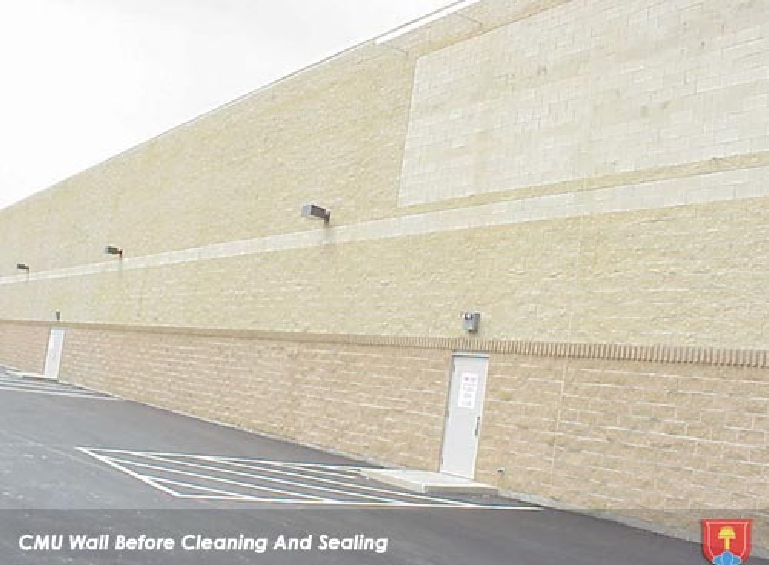
CMU Wall Before Cleaning And Sealing