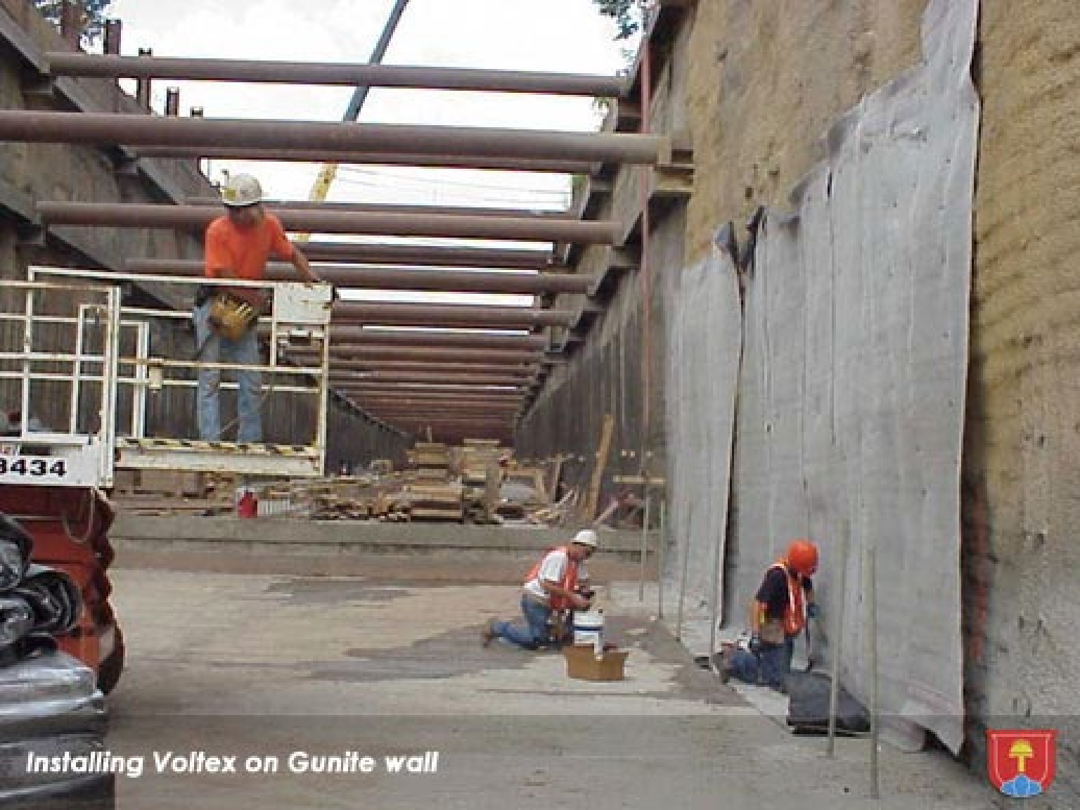
Installing Voltex on Gunite wall