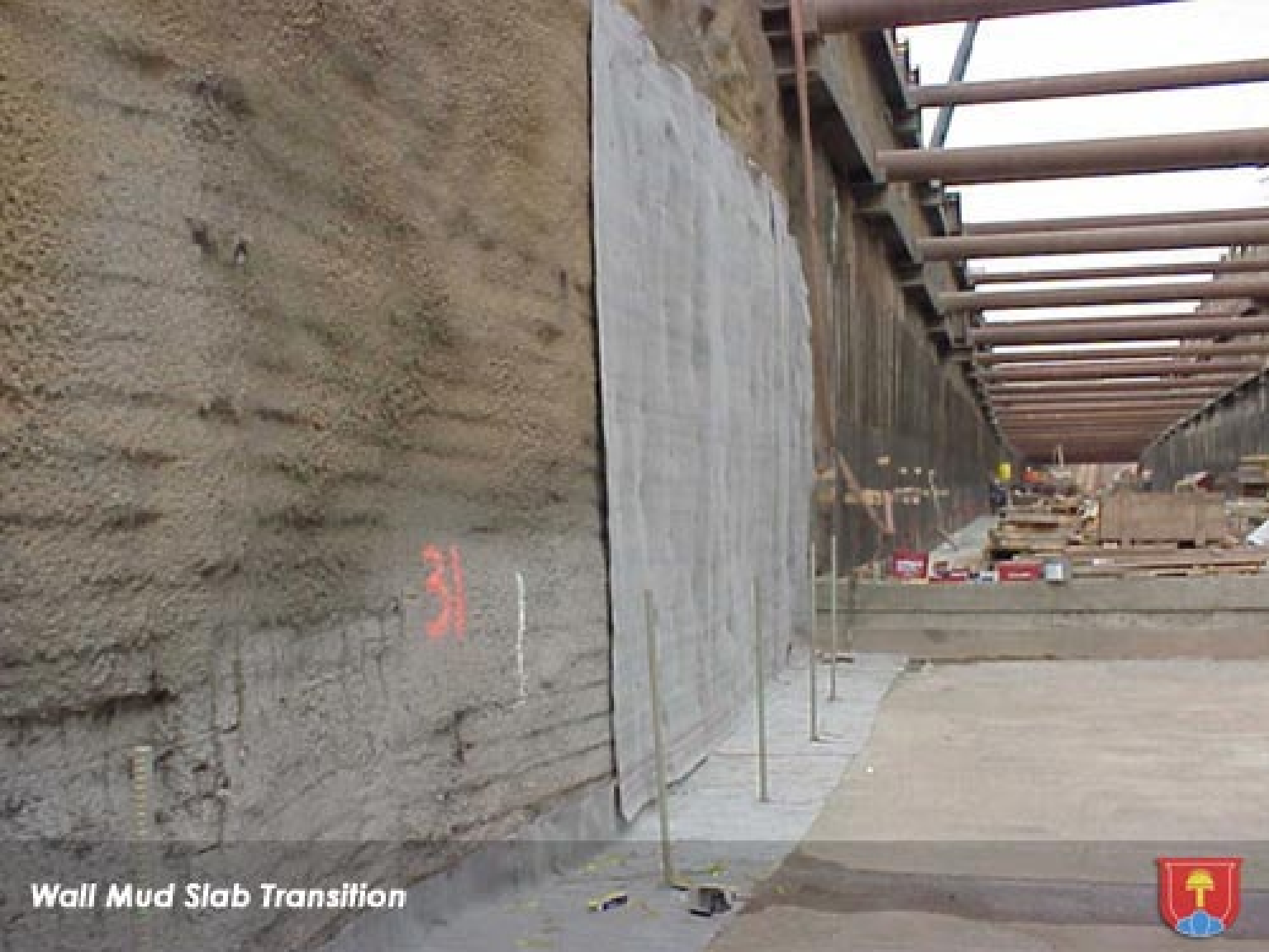
Wall Mud Slab Transition